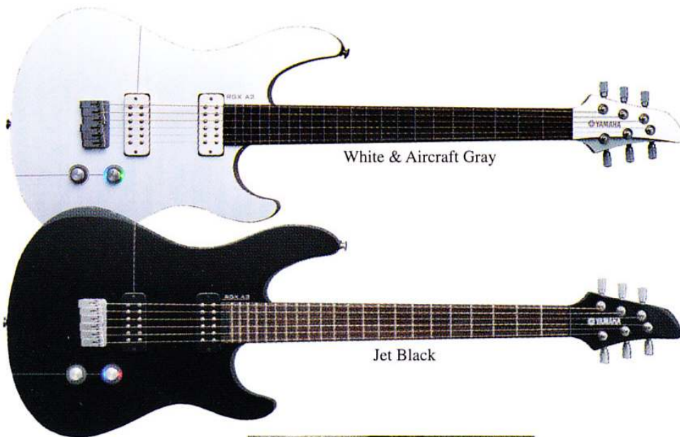
White & Aircraft Gray